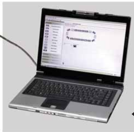
Laptop or PC is used to configure control of the lightbar