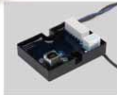
Electronic Control Module

An external interface unit, the WeCan electronic control module (ECM), communicates all lightbar operating functions (Super-LED and halogen) via a 2 conductor, 20 gauge cable.